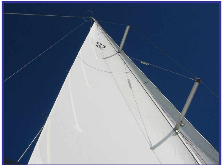
423 PBF Mainsail